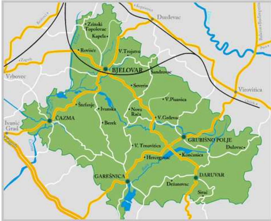
Picture 2. Bjelovar-Bilogora County

Bjelovar is cultural, economic and administrative centre of Bjelovar-Bilogora County. Town is situated at an important traffic position as it passes over the road and rail road connecting the major regional centers. Although is one of the youngest cities in Croatia, Bjelovar is now ranked among the most developed Croatian cities, and is important cultural and economic centre of the region.